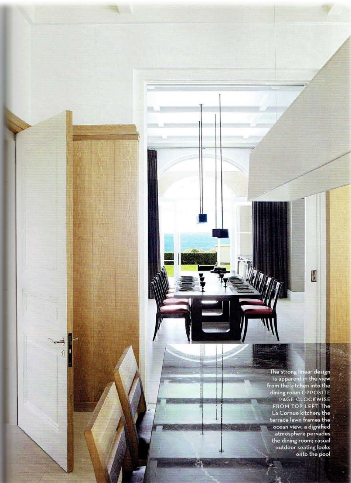
The strong linear design is apparent in the view from the kitchen into the dining room OPPOSITE PAGE CLOCKWISE FROM TOP LEFT The La Cornue kitchen; the terrace lawn frames the ocean view; a dignified atmosphere pervades the dining room; casual outdoor seating looks onto the pool