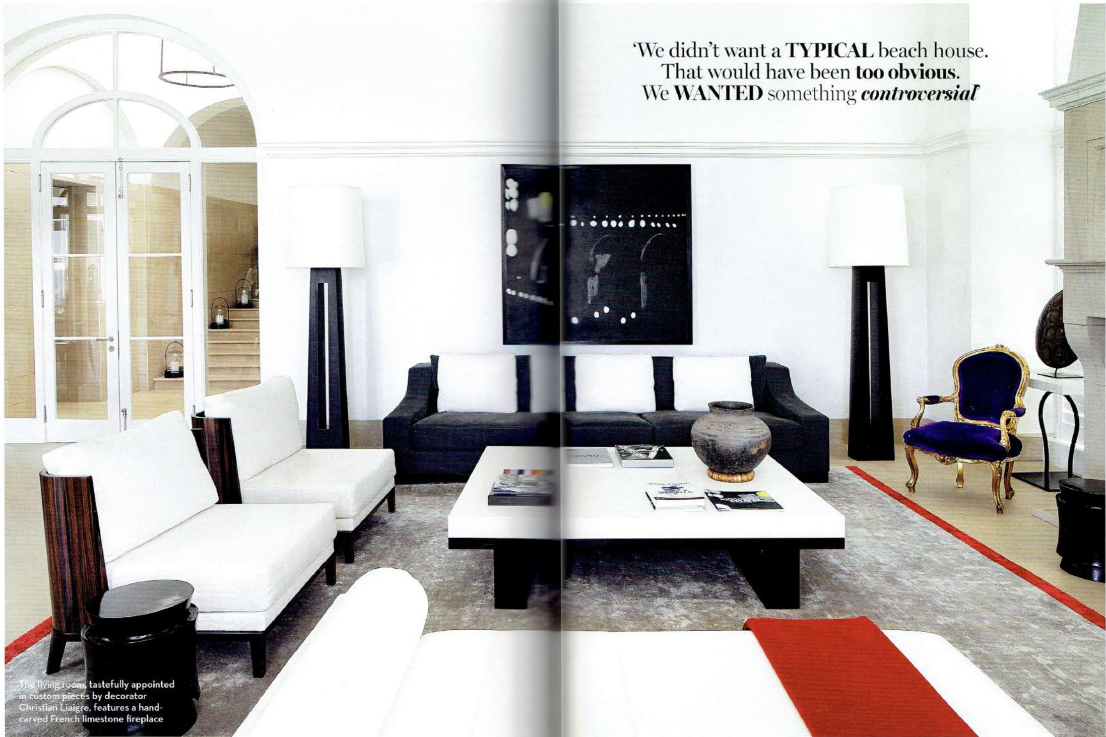
The living room, tastefully appointed in custom pieces by decorator Christian Liaigre, features a hand-carved French limestone fireplace

'We didn't want a TYPICAL beach house. That would have been too obvious . We WANTED something controversial